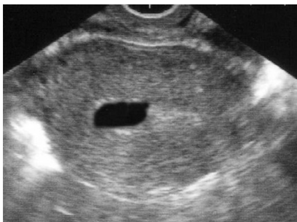
Persistent gestational sac

Persistent gestational sac: A persistent gestational sac, in which the sac is present but there is no viable embryonic tissue, occurs in less than 1% of medical abortions with the recommended mifepristone and misoprostol regimen (Creinin et al., 2004; Creinin et al., 2007; Winikoff et al., 2008). A persistent gestational sac is not a viable pregnancy and may be managed with aspiration, a second dose of misoprostol or expectant management according to a woman's preference. In a study of women with a persistent gestational sac within 11 days of medical abortion, a second dose of misoprostol was found to lead to expulsion in 69% of women (Reeves, Kudva, & Creinin, 2008).